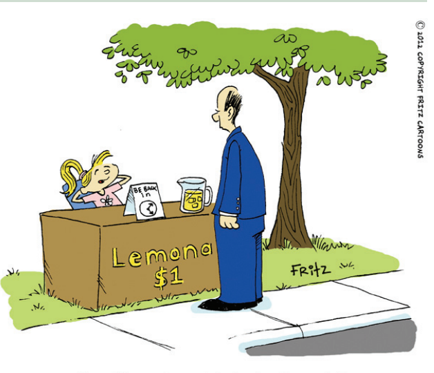
I'M CURRENTLY ON MY REQUIRED REST BREAK